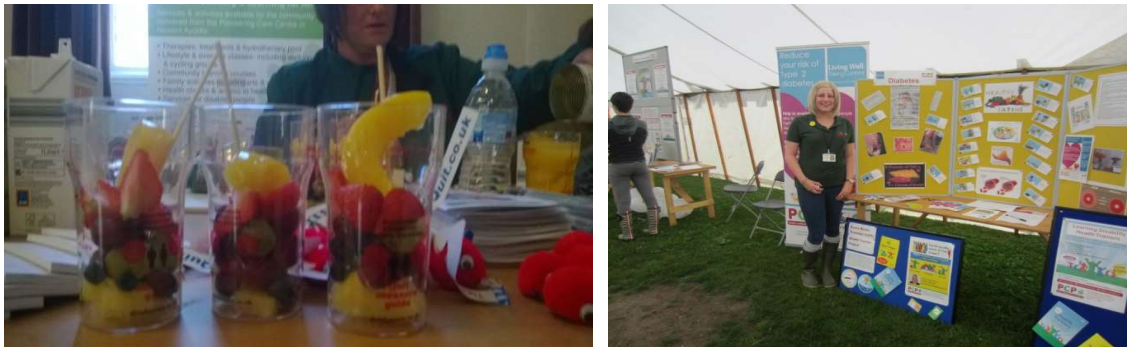
Fig 15. Health campaigns at Appleby Fair and local shows

The health trainers have also taken their service to Appleby Fair to raise awareness there and generated a lot of interest, particularly with the free fruit that was given out as an alternative to the less healthy food that is generally on offer. Many showed an interest in the service and in what they aimed to achieve. They have also held stalls at local events in County Durham. Such events are an opportunity to raise awareness of their service.