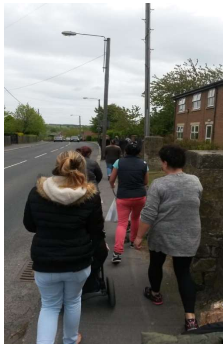
Fig 9. Health Trainer Walking Group at site C Summer 2015

At the request of some residents who want to increase their exercise level, MT and CG started to run a weekly Walking group. Although they needed to knock on doors each week to remind them of the walk, there were several regular attenders.