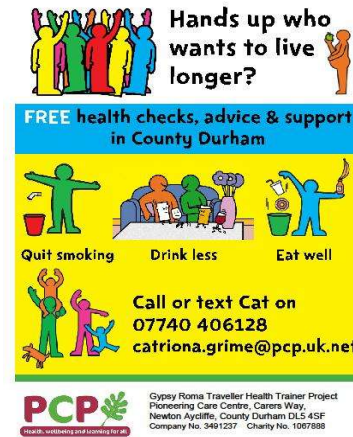
Fig. 6. Poster promoting health checks

to adults between the ages of 16 and 39 years. An important component of the Check 4 Life screening is the explanation of results and an opportunity to discuss relevant lifestyle changes. CG and MT are both trained to deliver these checks and mini MOTs and to offer tailored advice to all eligible adults on the GRT sites. Posters were displayed on the community buildings.