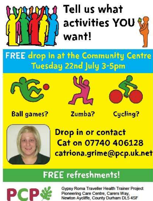
Fig 8. Poster promoting consultation on health related activities

Residents who had attended were then offered their second most popular choice of a boxercise class with a small cost to cover room hire. This activity, although requested, had even poorer attendance and the remainder of the classes were cancelled after no one turned up in the third week.