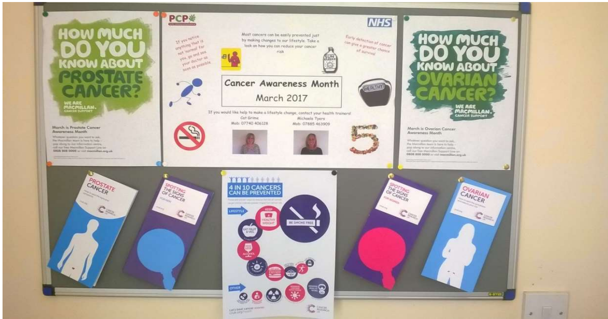
Fig.14 – Cancer awareness display

The health trainers have also taken their service to Appleby Fair to raise awareness there and generated a lot of interest, particularly with the free fruit that was given out as an alternative to the less healthy food that is generally on offer. Many showed an interest in the service and in what they aimed to achieve. They have also held stalls at local events in County Durham. Such events are an opportunity to raise awareness of their service.