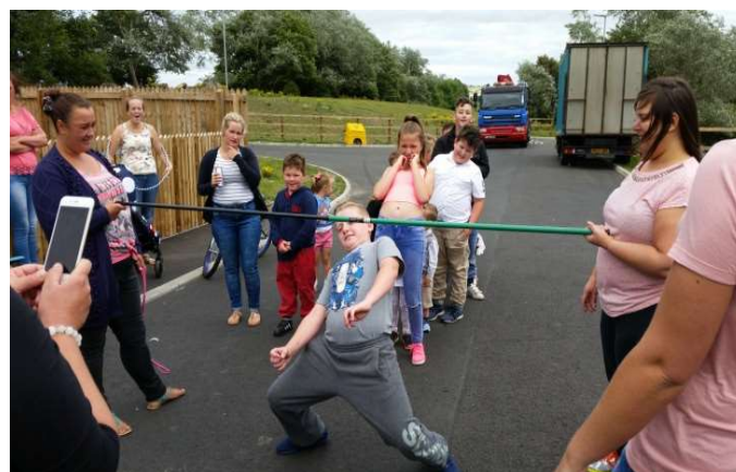
Fig 17 Sports day on site C