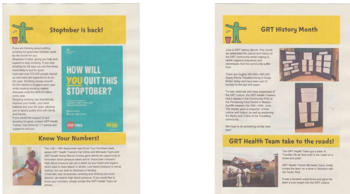
Fig 24 – pages from GRT health team newsletters

BC recently arranged for the GRT health team to attend some intervention training with the drug and alcohol team, called ‘Have a Word’. This will equip BC and the health trainers to raise the issue when unsafe levels of alcohol intake are identified at health needs assessments and to offer appropriate advice and support .