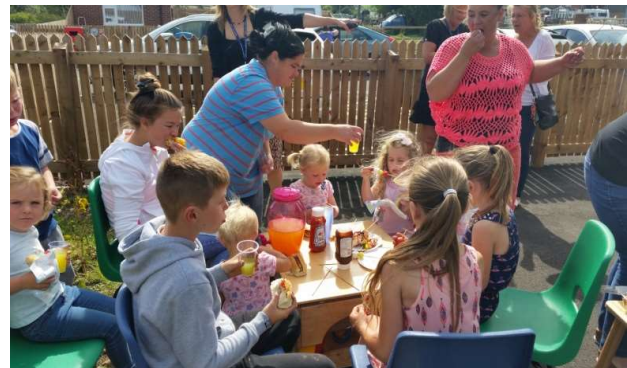
Fig 21 Youth Group and family activities

The team also used this event to invite DCC's Senior Partnership Officer, to consult with residents to help inform the Children, Young People and Families Plan and the Health and Wellbeing Strategy to ensure GRT inclusion