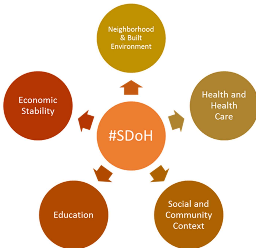
Figure 3 Social Determinants of Health

The GRT health status study 2004 demonstrated clearly that one of the key determinants of health for Gypsies and Travellers was their poor access to health care services.