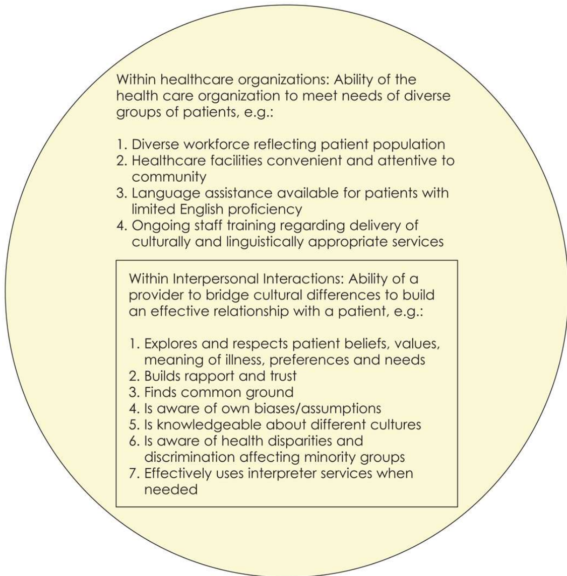
Fig 4. Key features of cultural competence (Saha 2008)