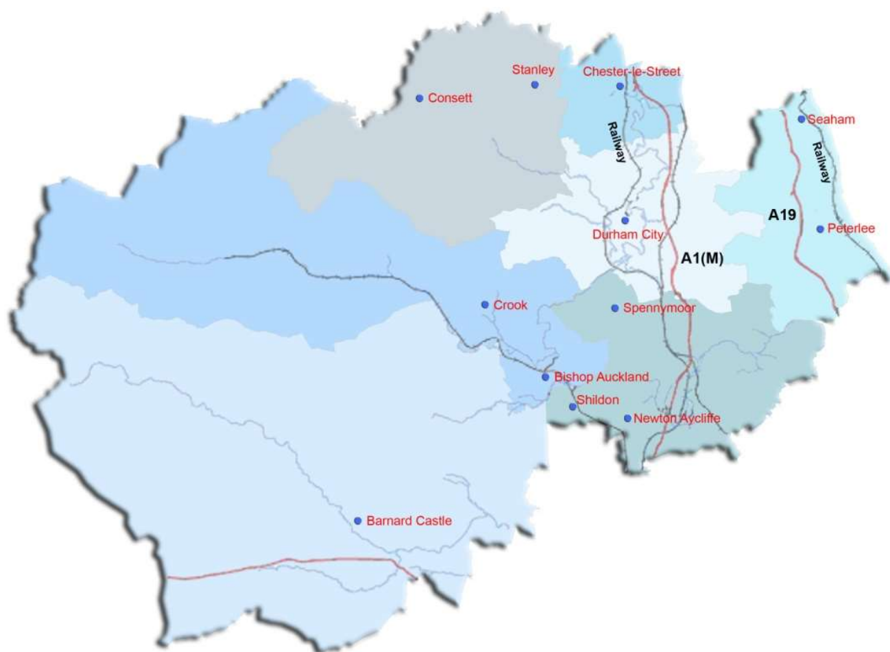
Figure 2 Map of County Durham and main towns

County Durham is a socially, economically and physically diverse area, covering 862 square miles (2233 square km) and home to nearly half a million people in 12 main towns and more than 300 smaller settlements, many of which are former colliery villages. Gypsies and Travellers are the largest ethnic minority in the county with the majority living in or around the Bishop Auckland area, either on caravan sites or in housing (see figure 2).