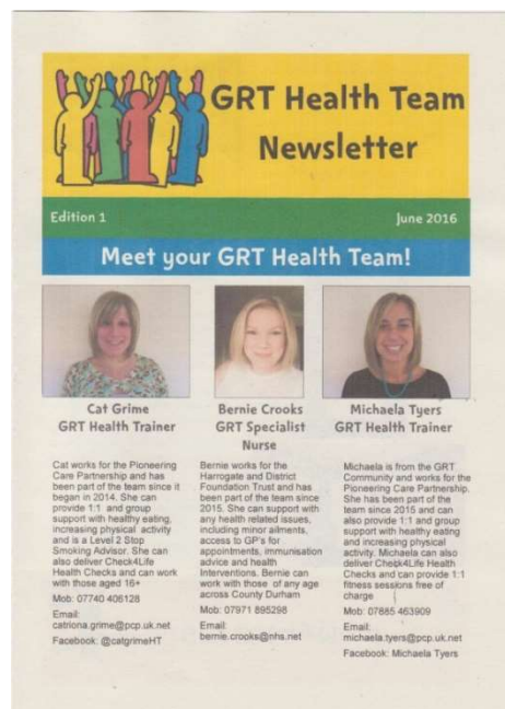
Fig 23 GRT team newsletter no 1

They also produced the first GRT health team quarterly, A4 size short newsletter that is distributed among GRT residents on the sites and in houses but is also circulated to other service providers electronically. In the first newsletter they produced a Meet the Team front page to promote their roles (see Fig 23 below)