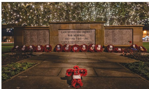
Lanchester war memorial