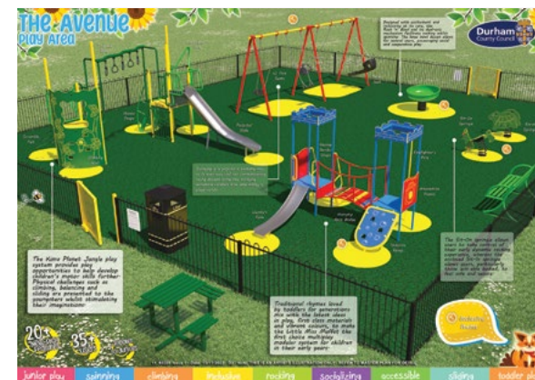
Burnhope play area design