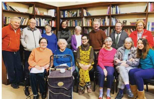
Forget me notes choir

For further information on the projects the councillors have supported, contact the AAP team.