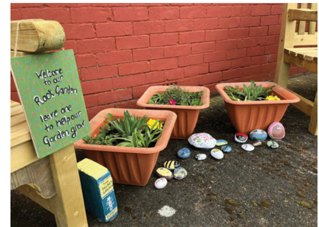
Rock garden at Crookhall Community Centre