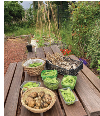
Community garden programme in Blackhill and Consett Park