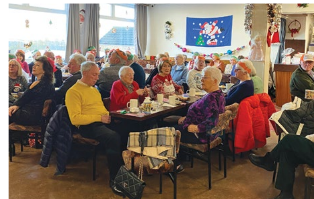
All Things Social

Room Hire - Howden Le Wear Toddlers group