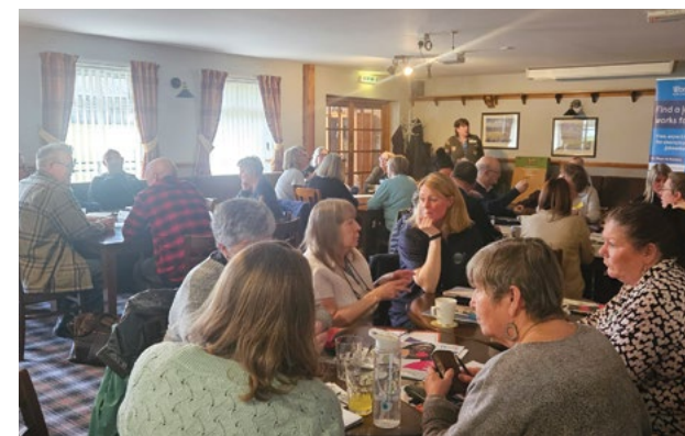
February network event