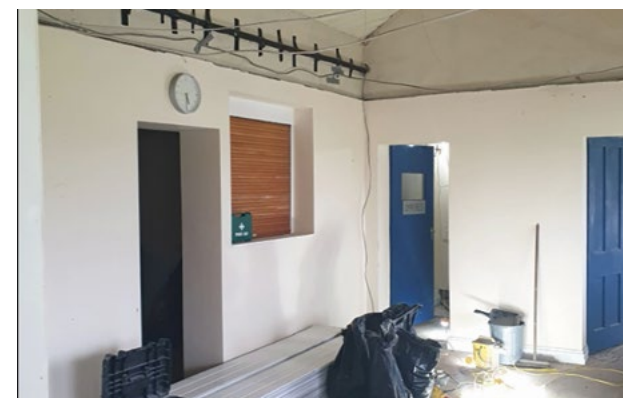
Willington cricket pavilion