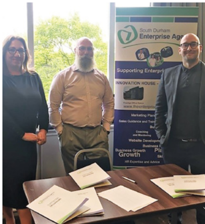
South Durham Enterprise Agency

projects supported through AAP and Councillor funding