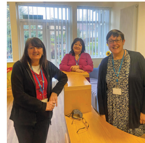
Butterwick Family Support