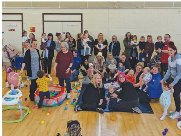
Jubilee Fields Playgroup