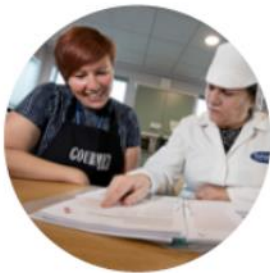
5,000 food businesses inspected