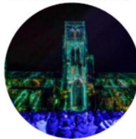
9 major events organised last year