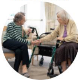
3,050 older people receiving residential or nursing care