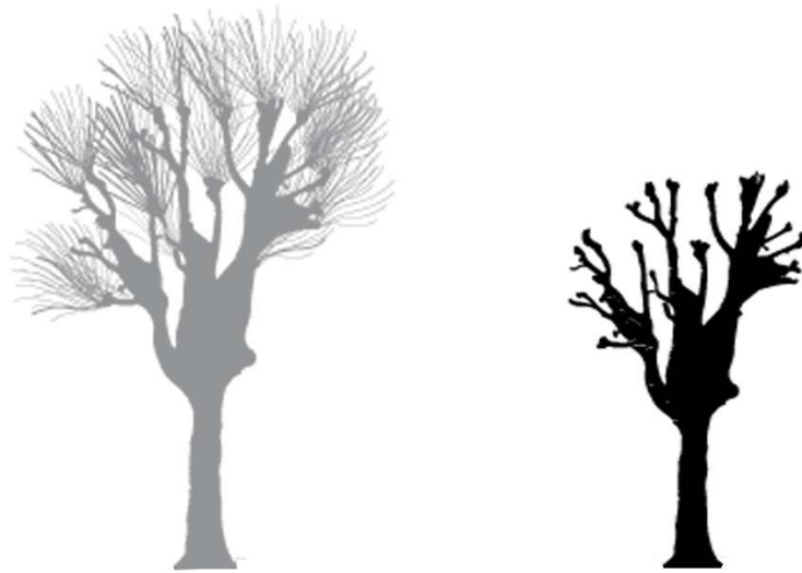
Pollarding: before and after