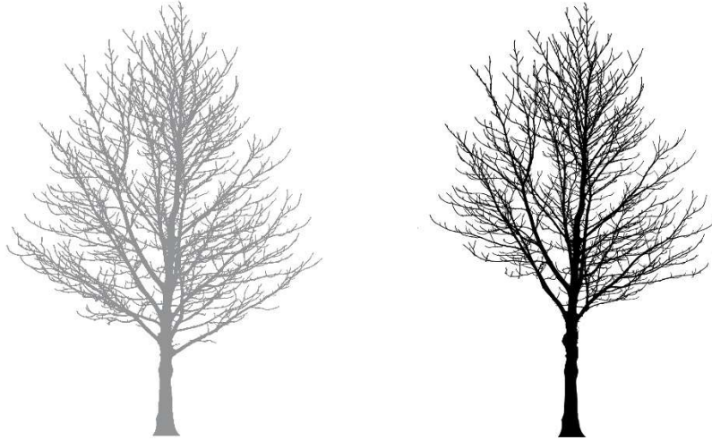
Crown lifting before and after