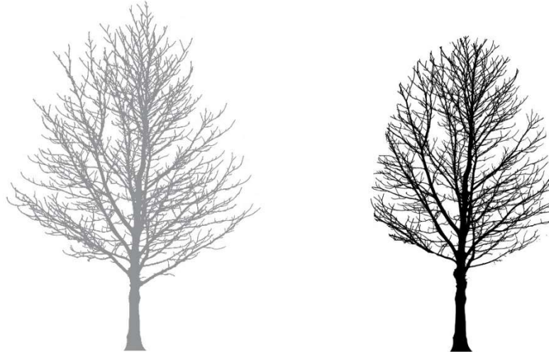
Crown reduction and reshaping: before and after