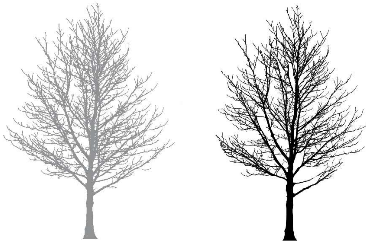
Crown thinning: before and after