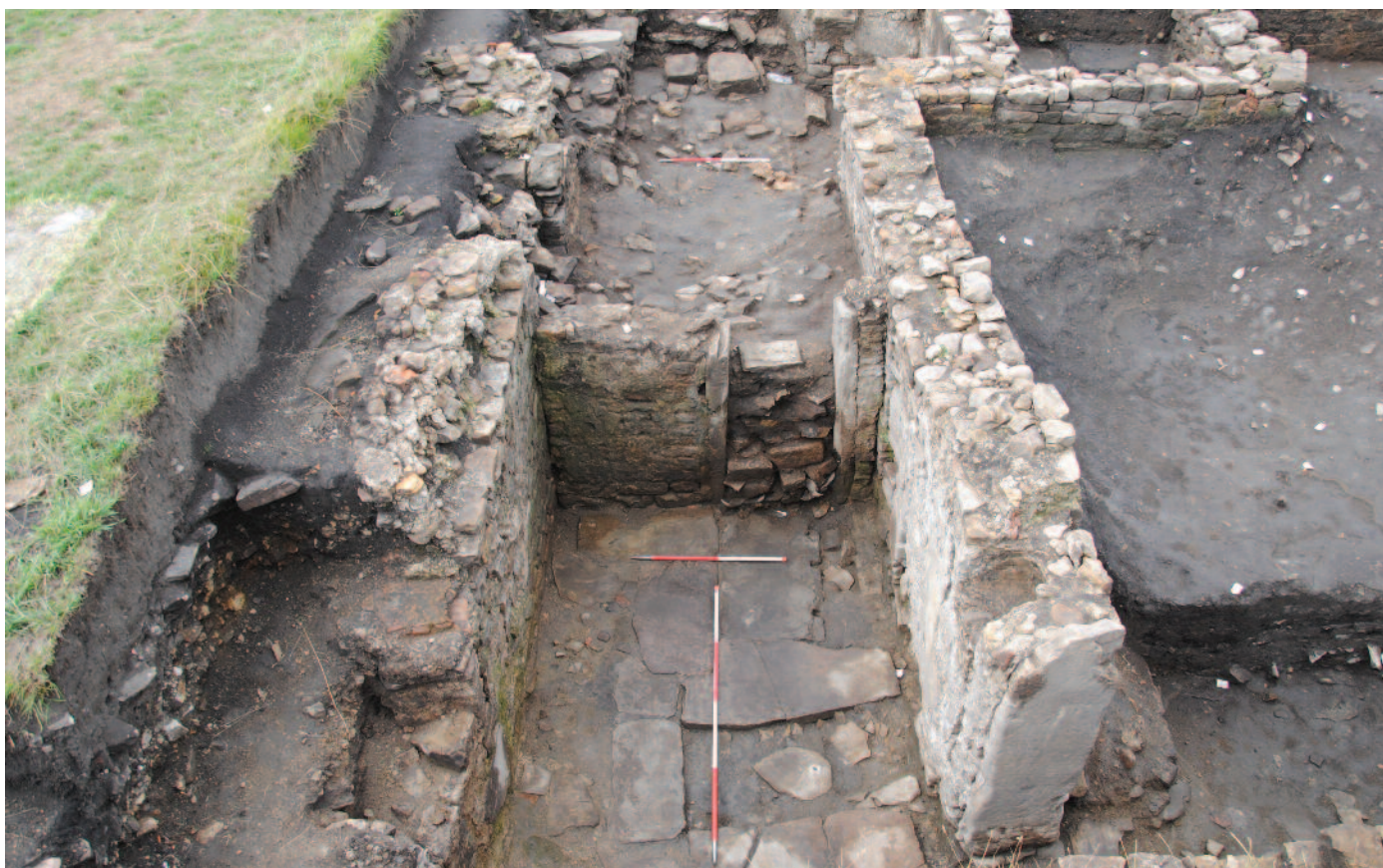
Trench 2 Bath building. View west along corridor