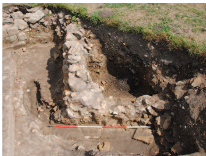
Severely robbed remains of angle-tower walls

The identity of the god in question is unknown as there is no accompanying inscription. Indeed, the head was only ever just that; it was never part of a