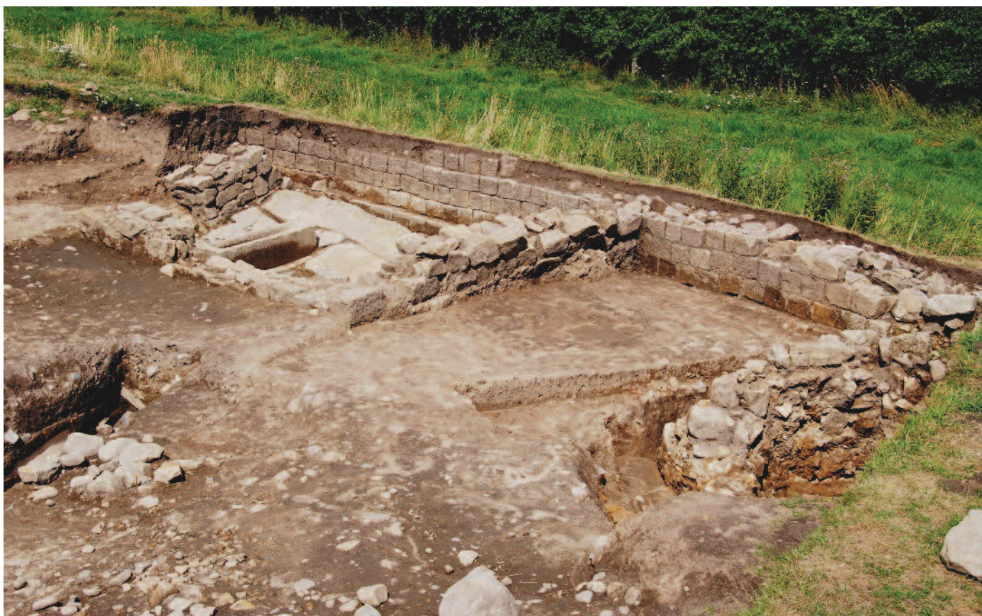
East corner of fort showing interior of fort wall, latrine and angle-tower