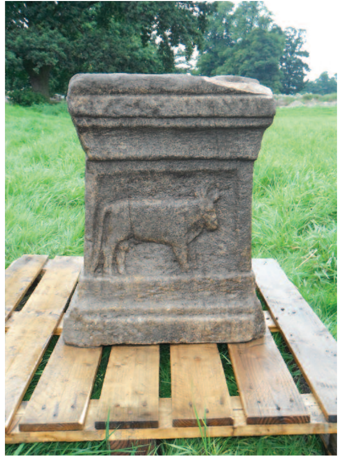
Inscribed altar bearing dedication to 'Fortune the Home-bringer'

gladly, willingly and deservedly fulfilled his vow. The dedication is of particular importance because although there is plenty of evidence for architects serving with the legions there is very little attesting their presence in auxiliary regiments. The infilling of these rooms almost to ground level with rubbish was not the final episode in the life of this building. Overlying the refuse deposits in the apodyterium was a layer of rubble that gave the appearance of discarded material from the core of demolished walls. Later still a substantial if crudely built rectangular structure roughly 6 by 4 metres in size was erected in the narrow space between the bath-building and the road. Equipped with a flooring of large stone slabs this structure was subsequently extended northwards. Two layers of substantial paving laid over the rubbish deposits in the neighbouring chambers in the bath-building may be contemporary with one or more phases of this late structure perhaps indicating that it had been brought back in to use one last time before its final abandonment.