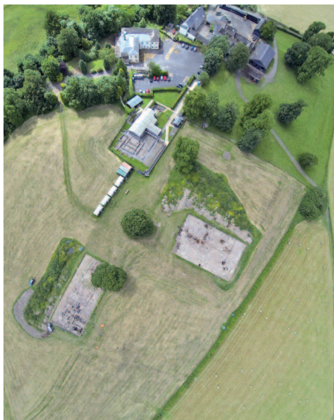
Aerial plan view of Binchester showing location of trenches in relation to rest of the site.

small porch added to the exterior. The final feature worthy of mention is a small semi-circular recess high up in the face of the north wall of the 'corridor' just short of the late doorway. A less well-preserved counterpart exists in the opposite wall. These could have housed items of sculpture appropriate to such a building or perhaps more mundanely lamps to illumine an increasingly dark interior.