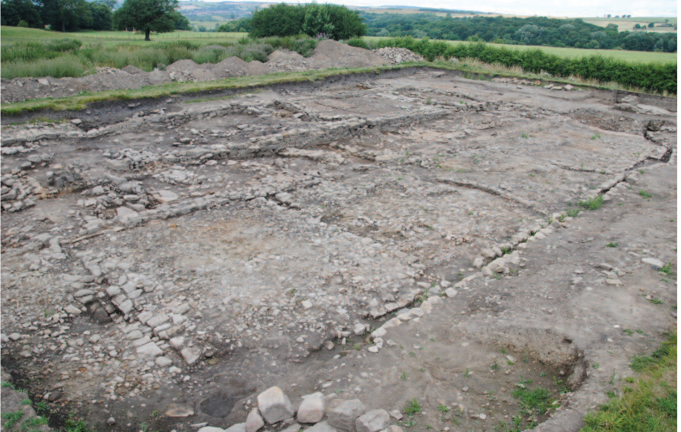
Trench 1. View across intervallum road with cavalry barrack in background. Note numerous parallel drains exiting from barrack and heading for main drain along outer edge of road