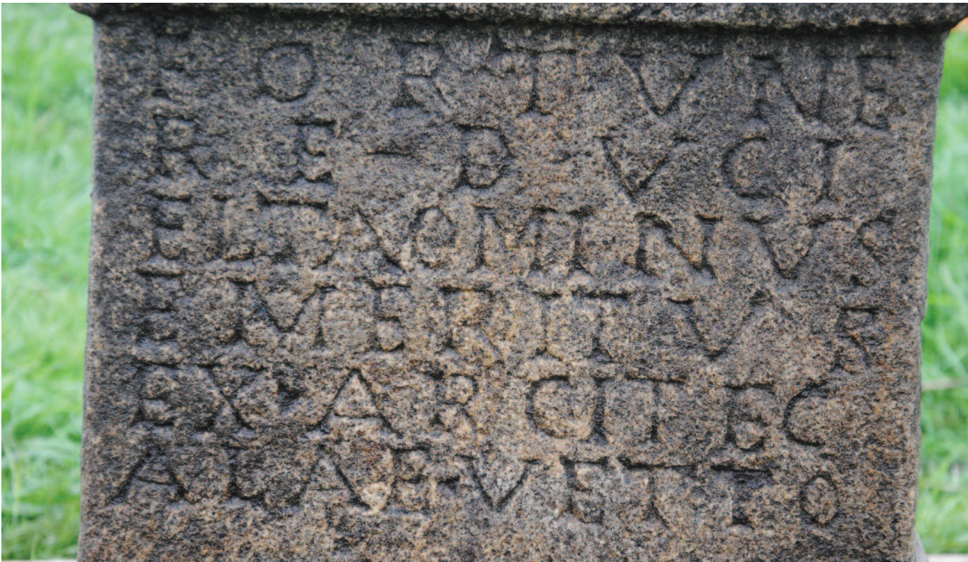
Close-up of text of inscribed altar