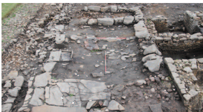
Trench 2. Bath-building. Late structure of several phases constructed in front of baths and partly overlying Dere Street. Note large slabs with small holes drilled into them of 'park-railings' type. Also realigned roadside drain