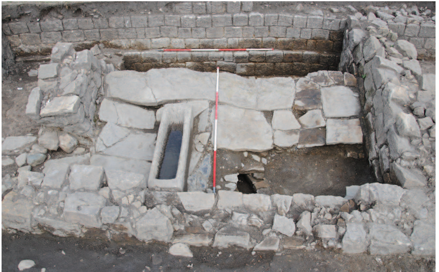
Latrine building looking east