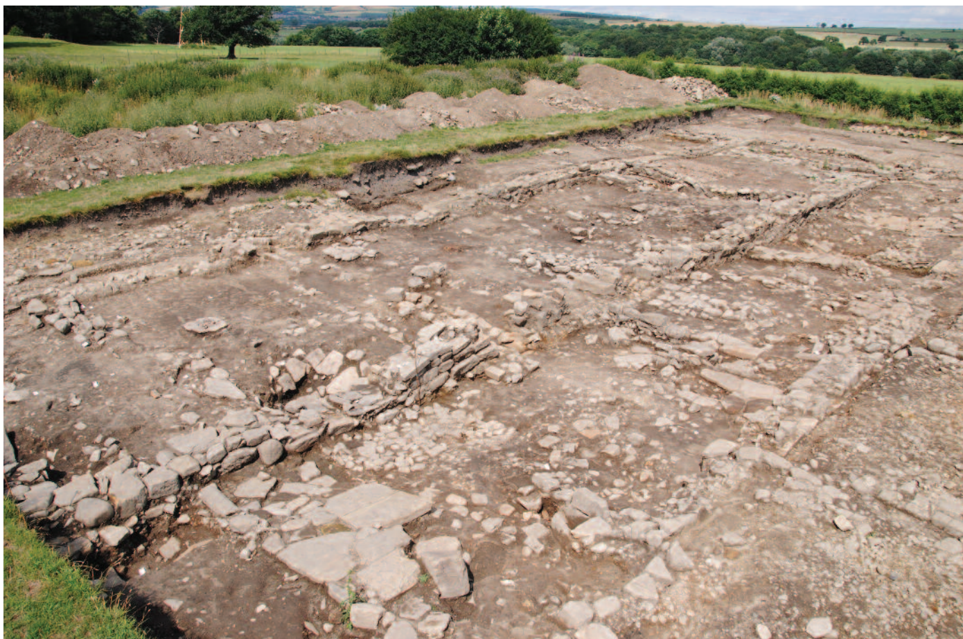
Trench 1. View across cavalry barrack with original front wall at right and later front wall of narrowed building at centre

At the east corner of the fort the inner face of the fort wall - generally thought to be of early 3rd Century date - has been exposed to reveal finely dressed masonry. Part of the angle-tower has also been uncovered though its masonry has been heavily robbed. Immediately north of the tower a small latrine building attached to the fort wall has been exposed. Approximately 3.5 by 4 metres in size, this features a floor paved with large stone slabs - which because it was laid over the tail of the rampart has subsided towards the intervallum road - on which were found two stone troughs which presumably functioned as containers for water and cleaning materials. The raised seating bench had been constructed along the side formed by the fort wall. In the space below a drain exited through the fort wall via a superbly constructed arched culvert. From an investigation just outside the fort wall by Kenneth Steer in 1937