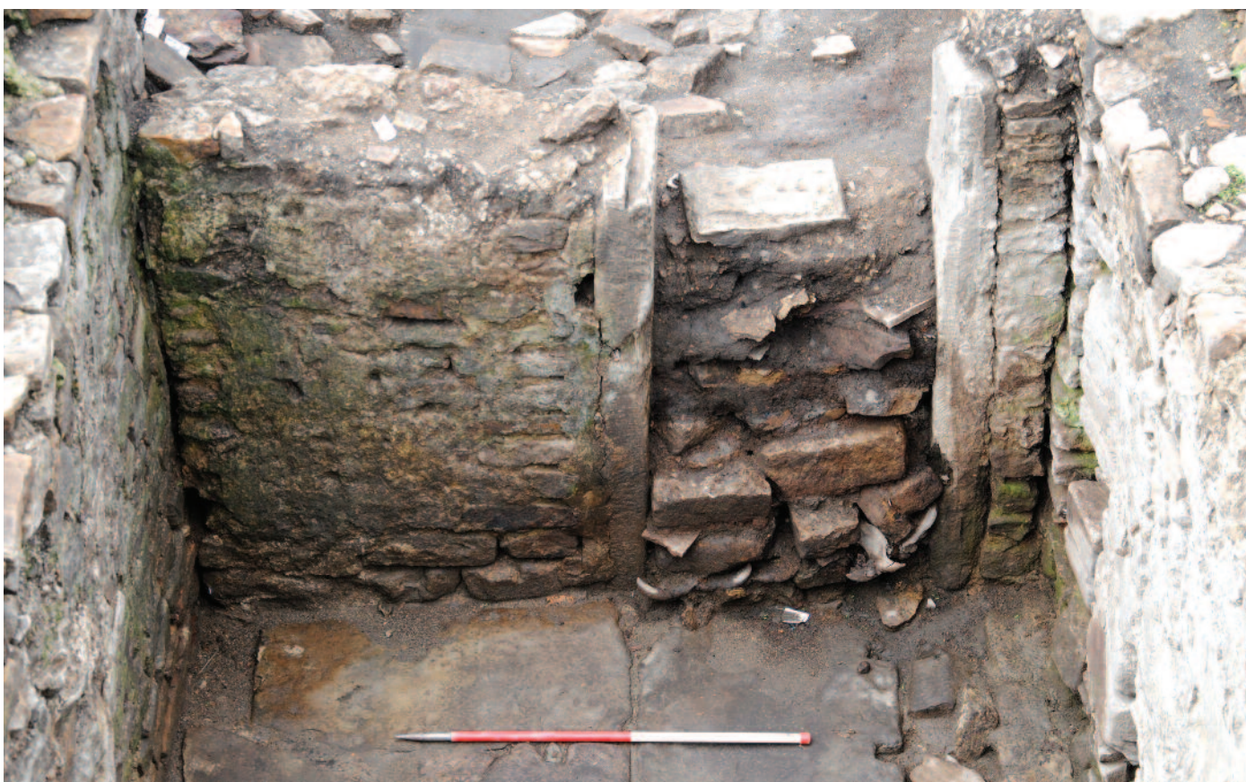
Trench 2. Bath-building. Rubble infilling of doorway in late cross-wall in 'corridor'