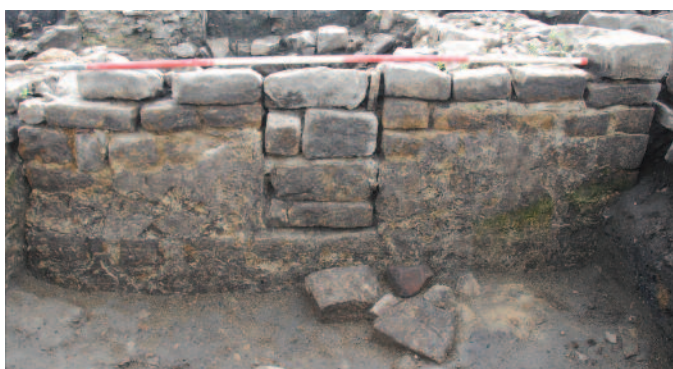
Trench 2. Bath-building. Blocked-up window embrasure in back wall of small chamber at west end of 'corridor'