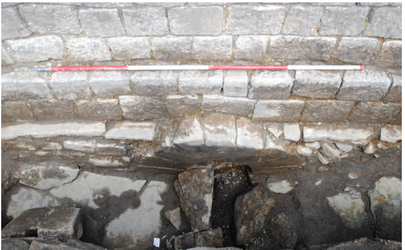
Arch in fort wall for latrine drain