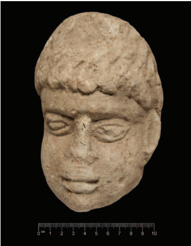
Carved head perhaps representing Romano-Celtic deity