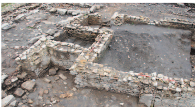
Trench 2. Bath-building. West end of 'corridor' and small chambers in extension. Note surviving springing of arch