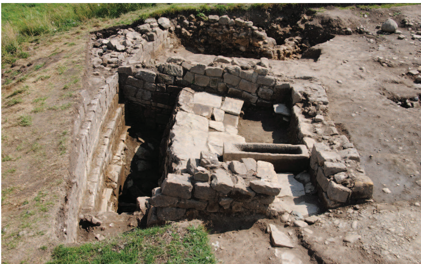
Latrine building looking south