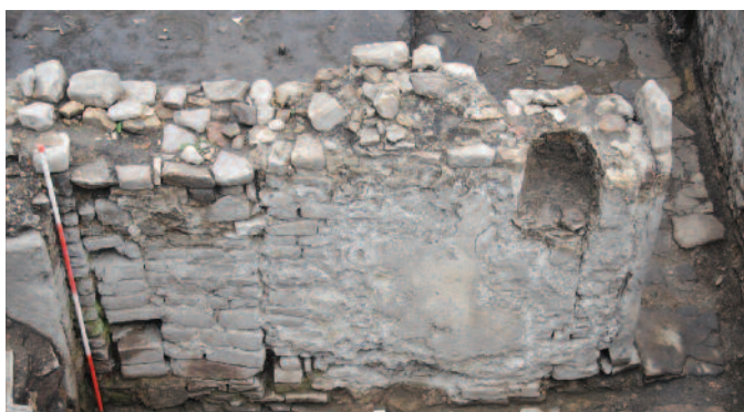
Trench 2. Bath-building. North wall of 'corridor' showing blocked doorway and recess