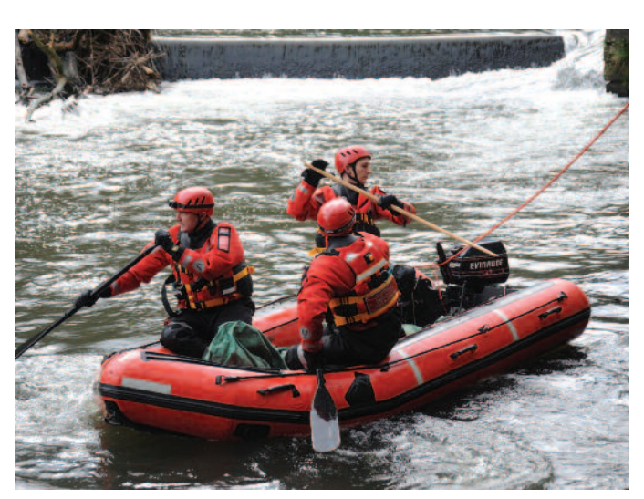
Fire and Rescue inflatable rescue boat